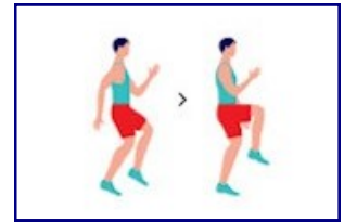
P.2 Get fit with HIIT!