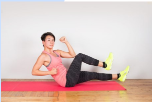
P.1 Bodyweight training

This month, we're looking at the top predicted fitness trends of 2017, so let's get training