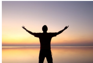
P.1 A breath of fresh air...