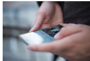
P.2 Top 3 fitness apps